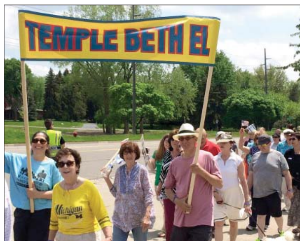
Temple Beth El participates in the 2015 Walk for Israel on May 17.