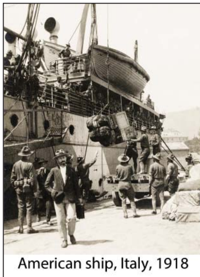
American ship, Italy, 1918

Photographic preservation is a complex subject; indeed some archivists devote their entire careers to this specialty area. For the lay person, dealing with boxes and bins of photographic material may seem to be an overwhelming task; however, taken a bit at a time it is an important and worthwhile endeavor. The internet offers an abundance of information on the topic and the Archives' staff is always will to answer your questions. We can also provide you with the name of the archival supply houses that we use on a regular basis.