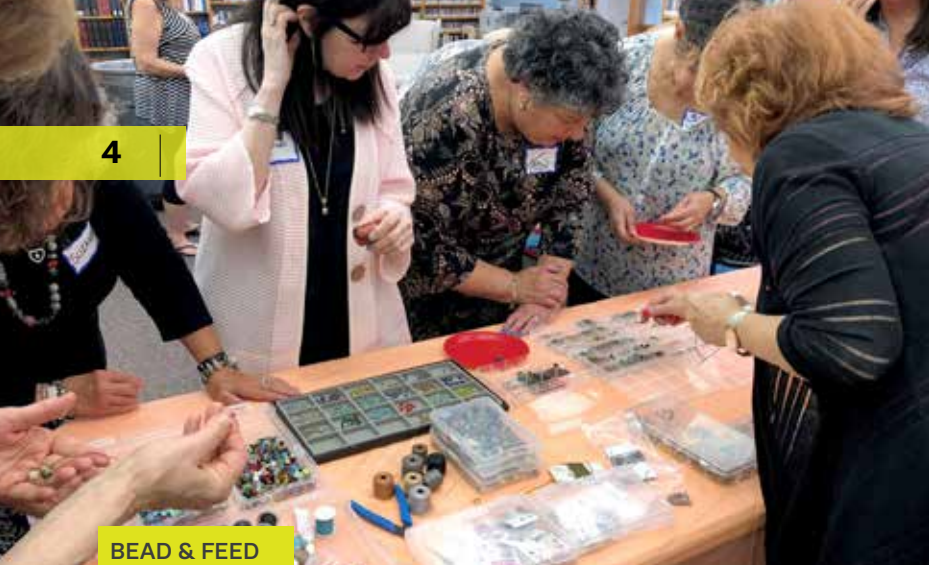
BEAD &amp; FEED