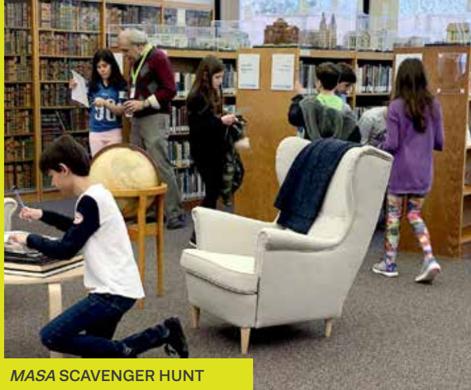
MASA SCAVENGER HUNT