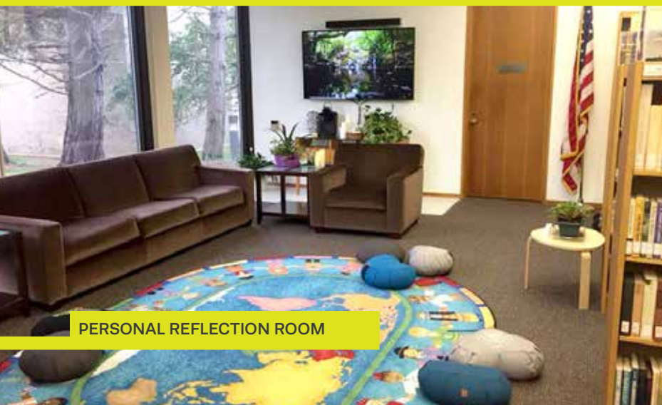
PERSONAL REFLECTION ROOM