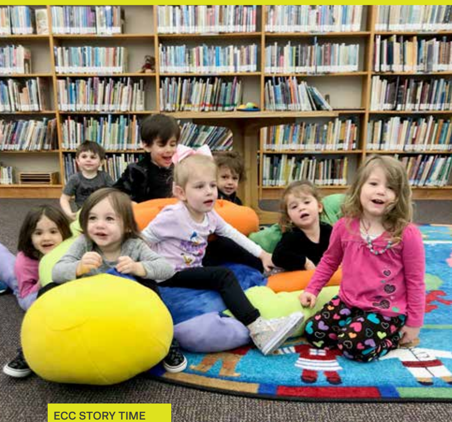
ECC STORY TIME