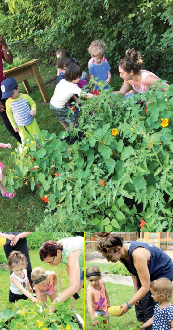
Camp Beth El campers working with Hazon volunteer to maintain our beautiful garden.